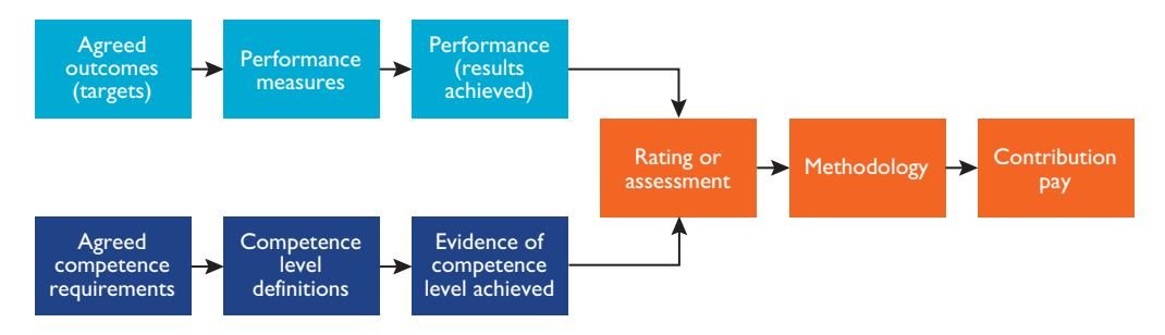
Figure 50.6 Contribution-related pay

A 'pay for contribution' scheme incorporating consolidated increases and cash bonuses developed for the Shaw Trust is modelled in Figure 50.7.